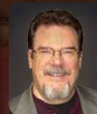
Gregg Harris Noble Institute