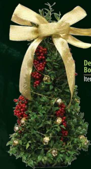
Decorated Boxwood Tree Item No. 9037 (pk. 4)