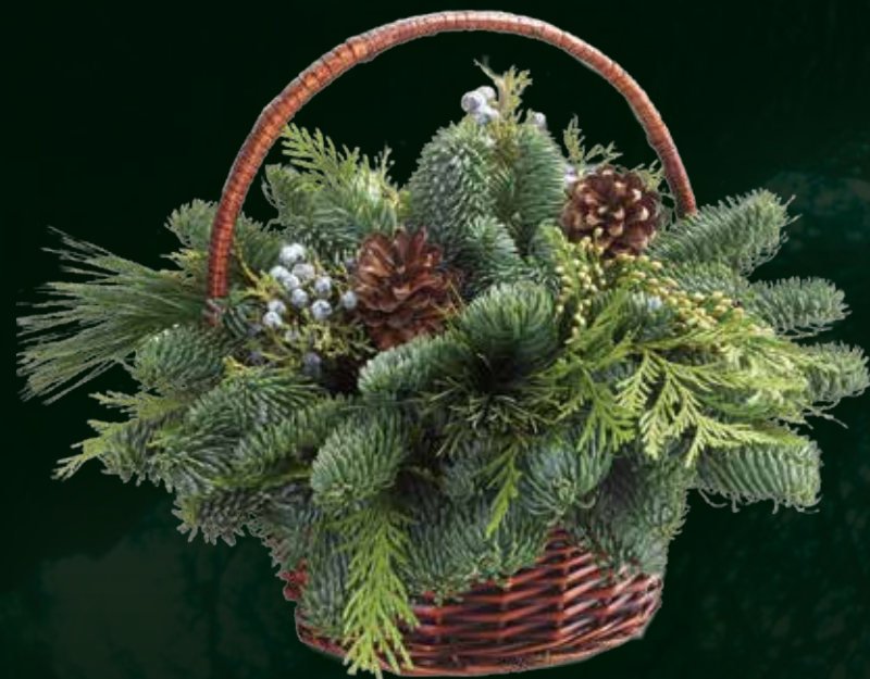
Basket Centerpiece Item No. 8069 (pk. 6) (2 red bows included)