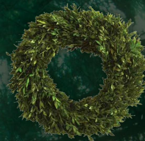
20" Boxwood Wreath Item No. 9032 6/bndl