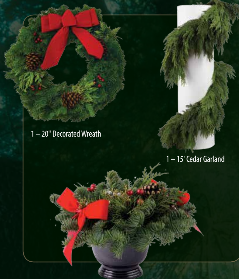
1 – 20" Decorated Wreath