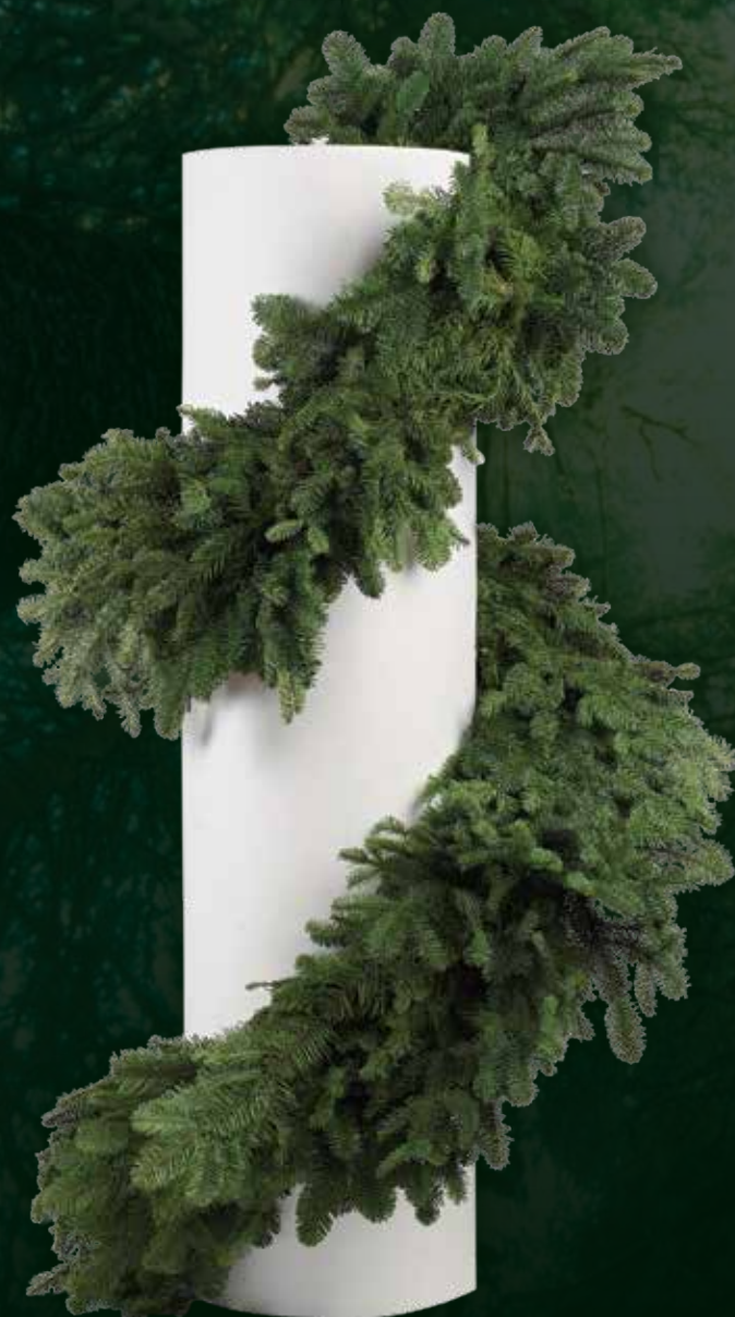
Noble Fir Garland