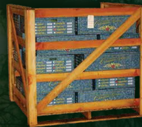
1 – Peppermint Shaker