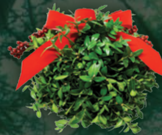
Kissing Ball Item No. 9036 (pk. 6)