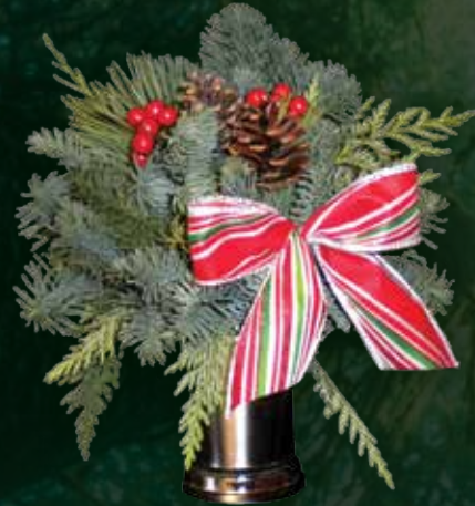
Peppermint Shaker Item No. 8075 (pk. 10)