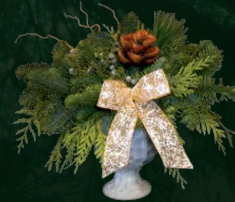
Memorial Urn Item No. 8263 (pk 4)