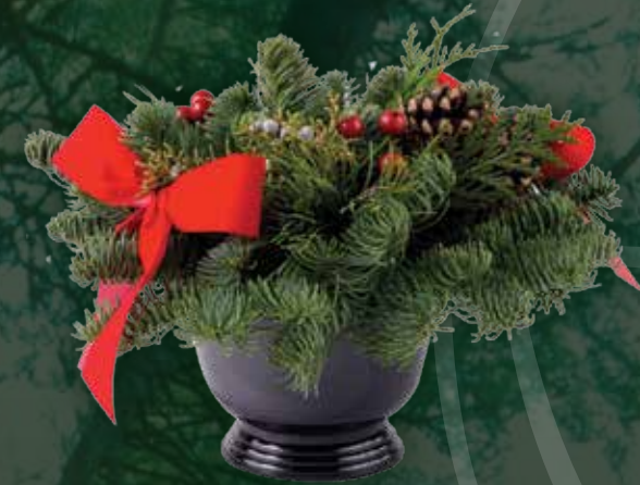
Holiday Design Bowl Item No. 8076 (pk. 6)