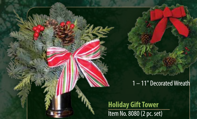
1 – 11" Decorated Wreath