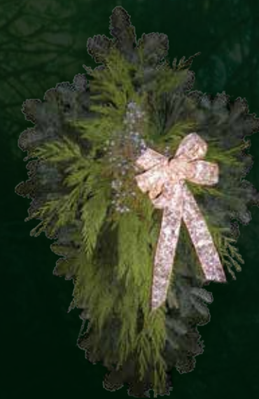
Memorial Spray Item No. 8262 pk. 8

Salal is an example of Memorial Items made with Western Greens. Easels for displaying wreaths, crosses and sprays are available through Continental Floral Greens Hardgoods Division.