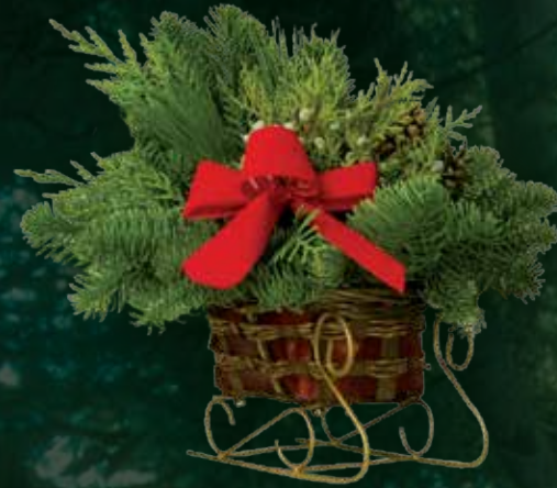
Holiday Sleigh Item No. 8077 (pk. 6)