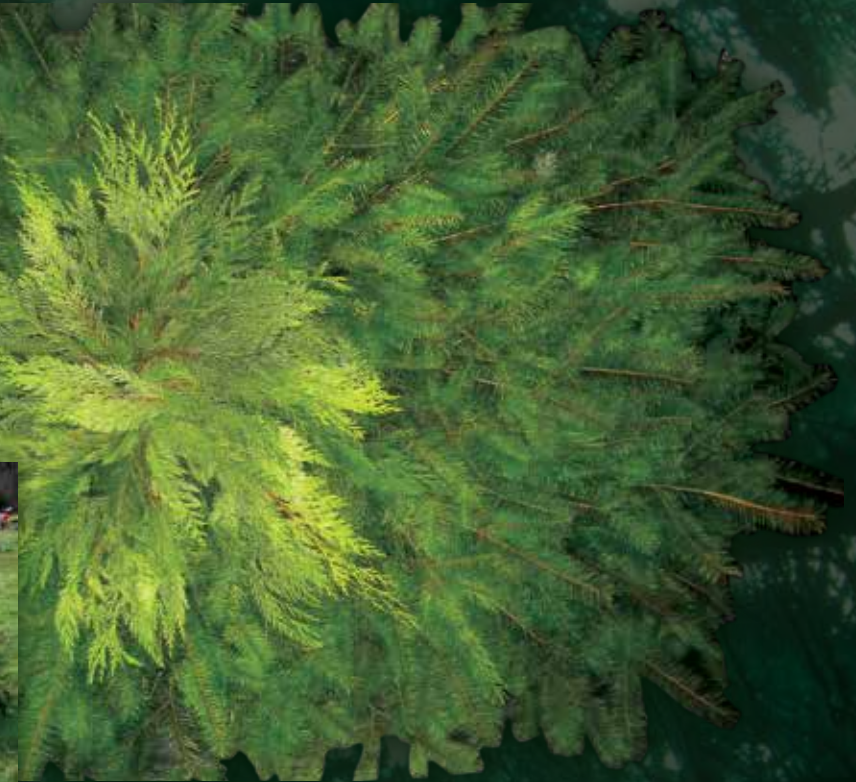
Deluxe Grave Blanket Item No. 8098 2/bndl