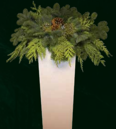
Tombstone Cover Item No. 8264 (pk. 6)