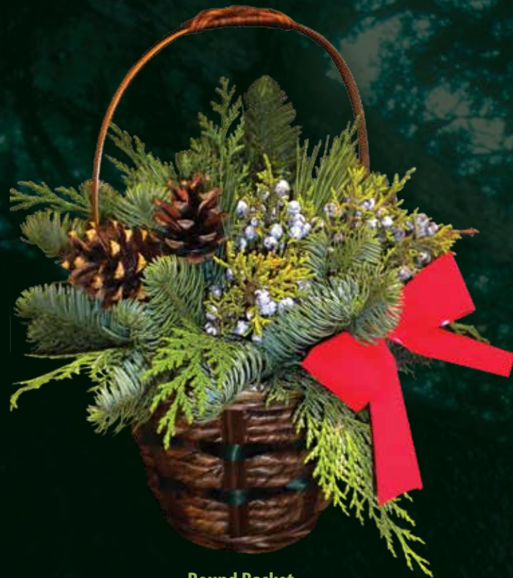
Round Basket Item No. 8068 (pk. 6)