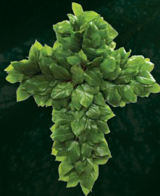
Memorial Salal Cross 30" x 24"

Salal is an example of Memorial Items made with Western Greens. Easels for displaying wreaths, crosses and sprays are available through Continental Floral Greens Hardgoods Division.