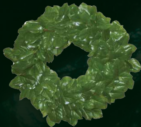
Memorial Salal Wreath 24"

Memorial items are also made available for all seasons in the many varieties of greens that Continental offers.